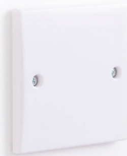
Example of Electric Relay Installed